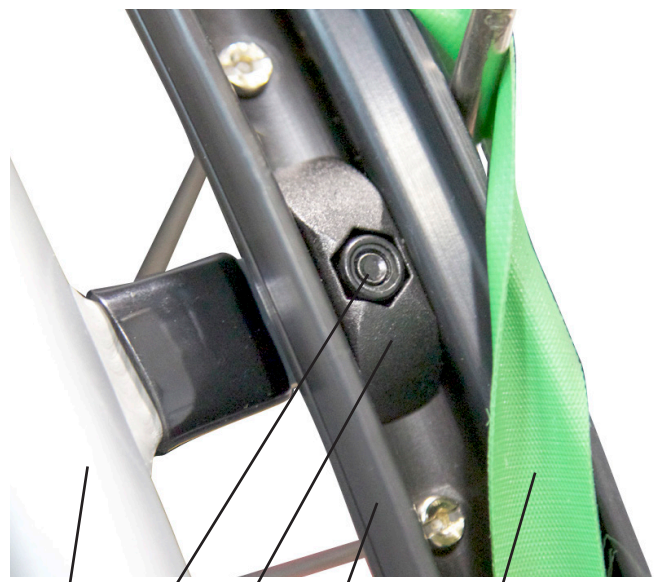
Handrim Nut Insert Rim Rim tape

The new plastic insert allows you to replace, remove or adjust the handrim without having to remove the tire to access the nut.