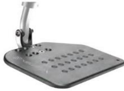
Angle adjustable Newton - composite