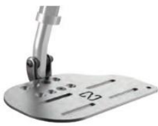
Angle adjustable Newton - aluminium

COMPATIBLE WITH THE FOLLOWING PALLET TYPES: (Installation is the same for all models)