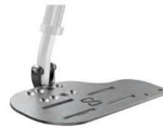
Extra deep angle adjustable Newton - aluminium