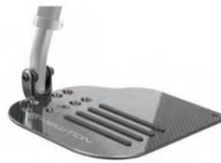
Angle adjustable Newton – carbon fiber with insert