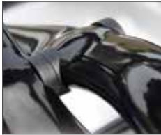
4 ULTRARIGID FOLDING SYSTEM Offers best-in-class propulsion efficiency