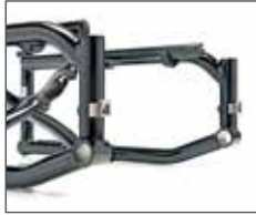
2 HYBRID FRAME DESIGN Eliminates the need for both hemi and standard frame, while providing a complete range of seat-to-floor heights