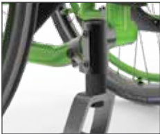
6 INTEGRATED CASTER HOUSING Offers simple and infinite angle adjustments