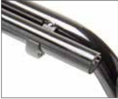
3 ALUMINUM SEAT RAIL With integrated seat slider for better seat sling support