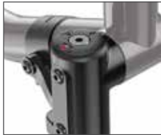
5 ANTI-FLUTTER SYSTEM Provides a smooth, more efficient ride