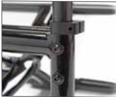
1 REINFORCED BACK CANE SUPPORT For added stability and comfort