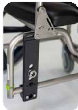
Fore / aft adjustable axle plate allows for center-of-mass (COM) adjustment

The Raz-SP600 Self Propel Bariatric Mobile Shower Commode Chair has been specifically designed for a weight capacity of up to 600 lbs. It features the Multi-Position Back (with center of gravity adjustment) The Raz-SP600 will provide maximum comfort and maneuverability for users who require a self-propelled heavy-duty shower commode chair.