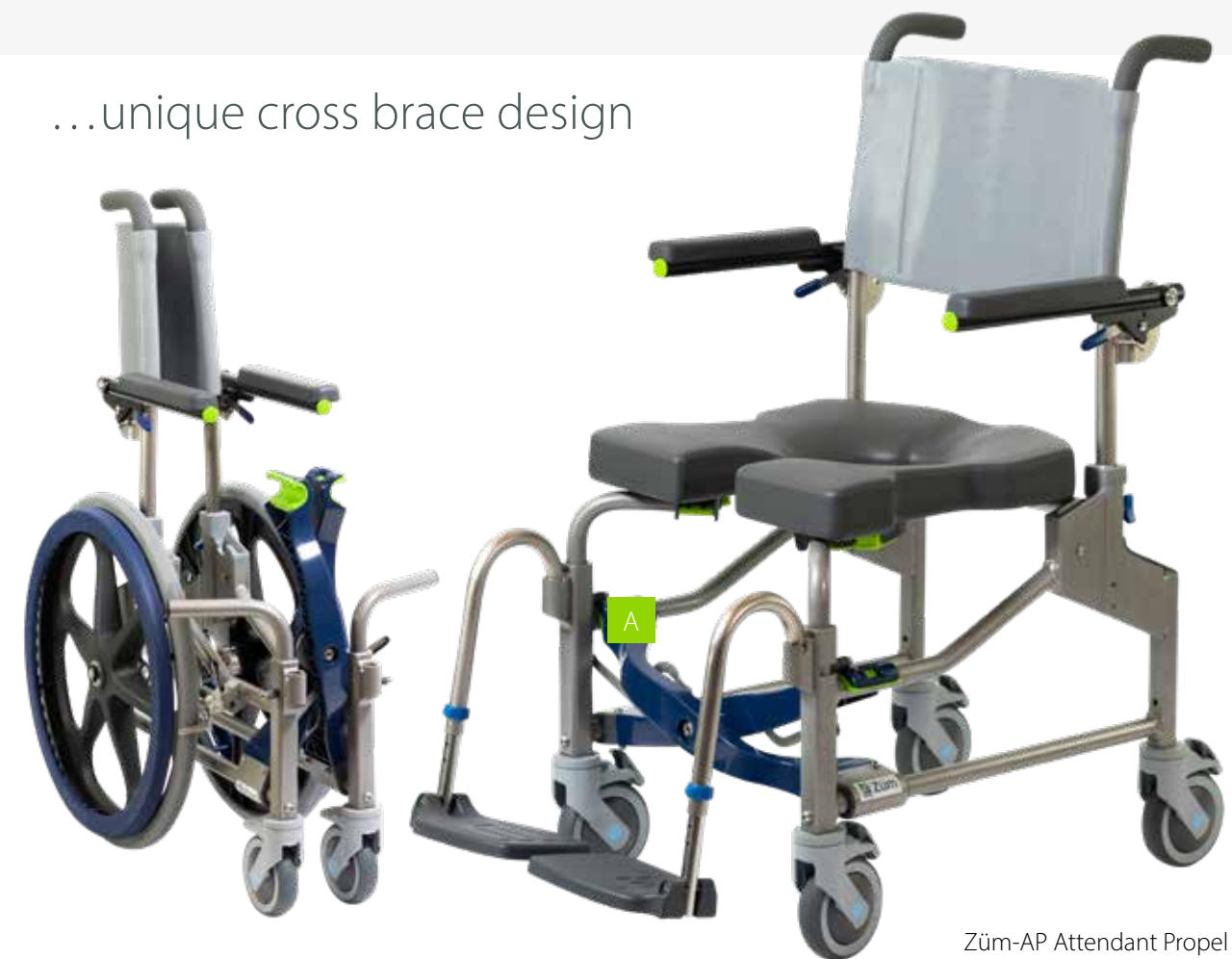
Züm-AP Attendant Propel

A The Züm's unique front cross brace is made of cast aluminum. The centre pivot is curved and positioned low and forward on the frame for better aperture/bowl alignment.