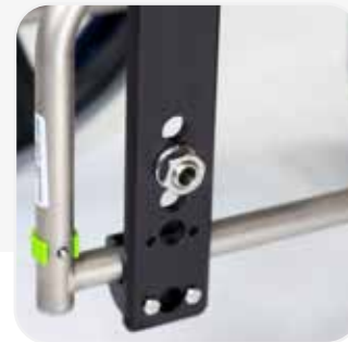
ADJUSTABLE AXEL PLATE

The Raz Mobile Shower Commode chairs are designed and manufactured to the highest standards of the discerning health care professional.