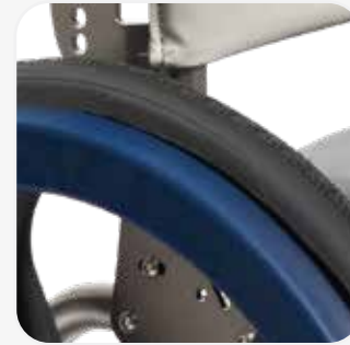
ERGONOMIC HAND RIM WITH THUMB GROOVE AND FINGER NOTCHES